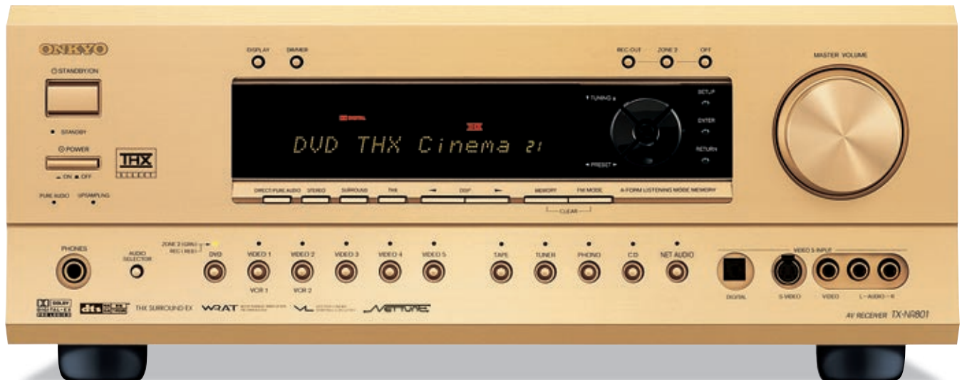
Available in Gold or Black